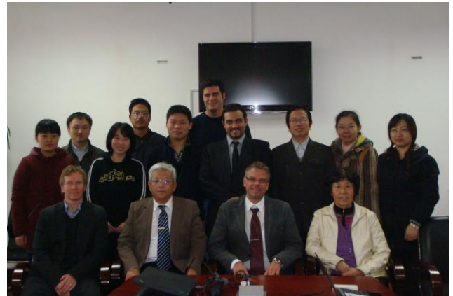
Fig. 1: Meeting at Capital Medical University