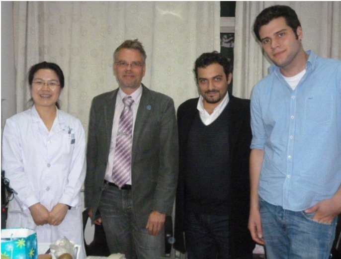
Fig. 3: Meeting at 1 st Hospital of Tsinghua University