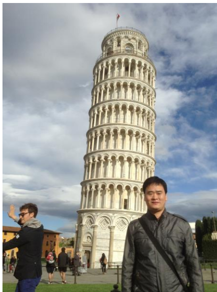
Visiting the landmark of Pisa.