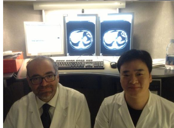
Demonstrations presented in the LAB.