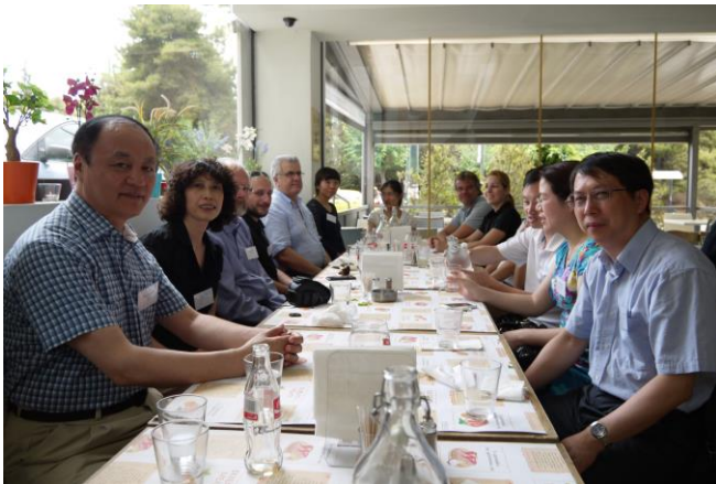
A working lunch during the workshop has enriched their experience in collaborating together towards the development of global digital hospitals.

During the meeting and workshop, a number of administration issues have been discussed, in particular, on the allocation of resources for the incoming visitors, in addition to many other collaborative ideas.