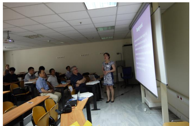
Wang from Tsinghua detailing the clinical application of both 2D and 3D echocardiography scanners.