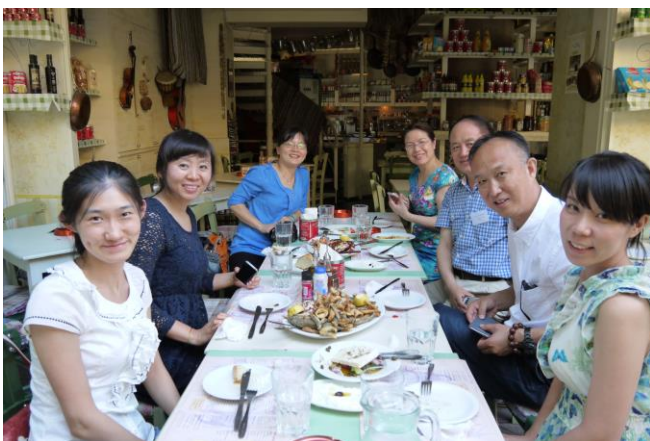
Social network reaching a fruitful level.

All in all, the workshop and the meeting were a great success despite of the difficult economic situations experienced in Greece. As a direct result, the refunding process took a bit longer than expected.