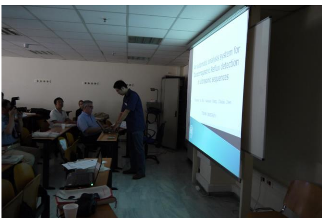
Ma from Fudan presenting their research results on ultrasonic images.