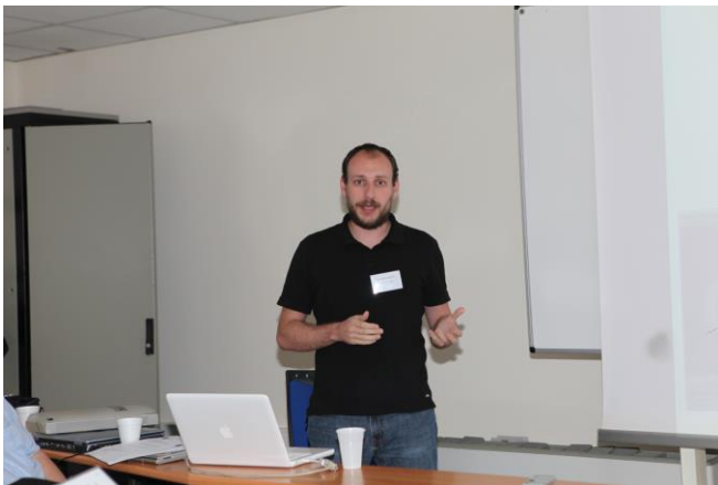
Markonis from HES-SO illustrating user-oriented design in the development of CBIR systems.