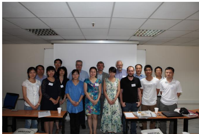
Meeting in the front entrance of Middlesex University, UK.