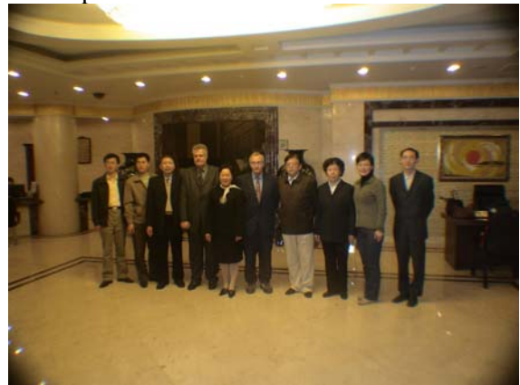
The event has attracted media attention and well reported.