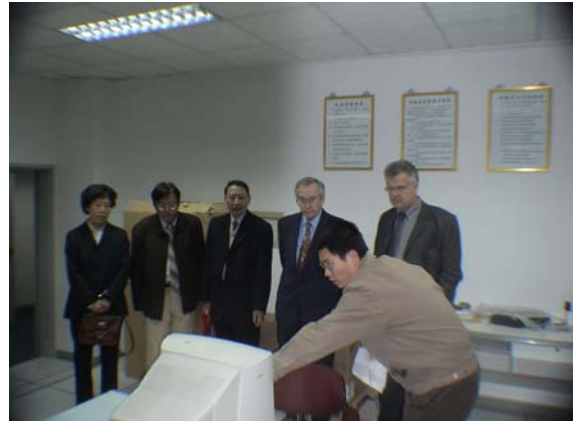
The event has attracted media attention and well reported.

working place and was given demonstrations on the currently research development linked with TIME project.